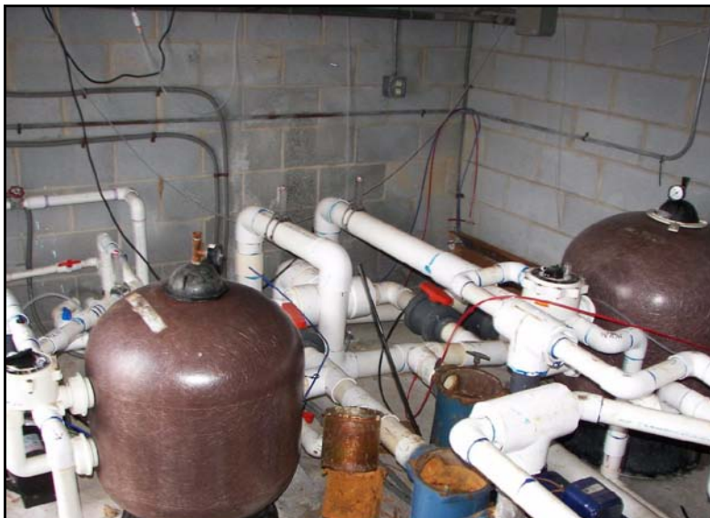
Pool mechanical equipment