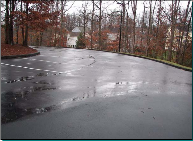
Asphalt pavement parking lot