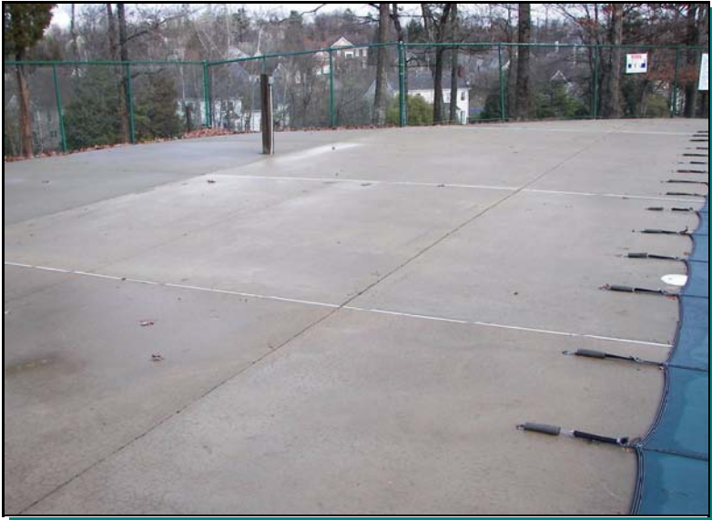
Concrete pool deck overview