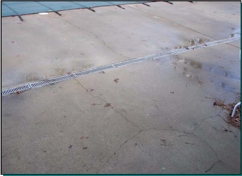
Concrete pool deck - Note cracks