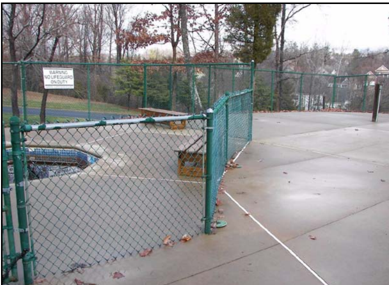
Pool fence - Note finish deterioration