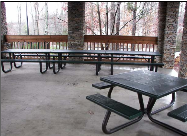
Plastisol picnic tables