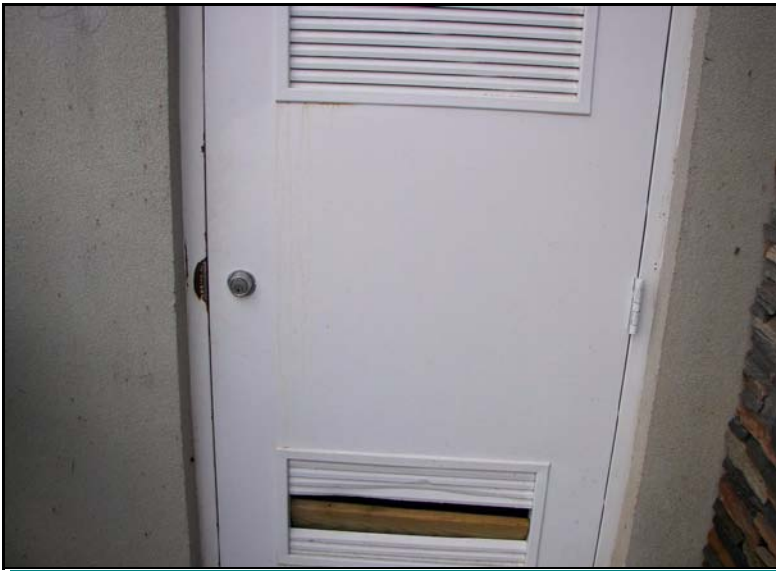
Metal door - Note broken section