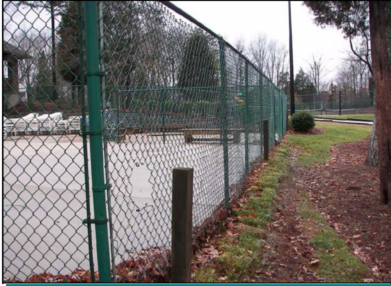
Pool fence - Note hole