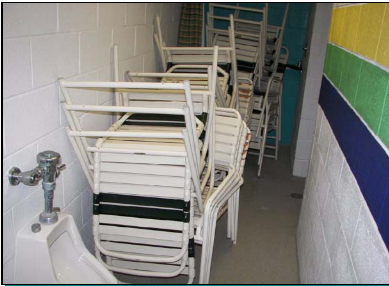
Pool furniture in mens rest room