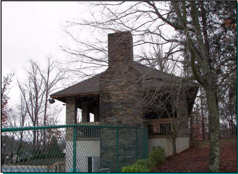
Pavilion side elevation