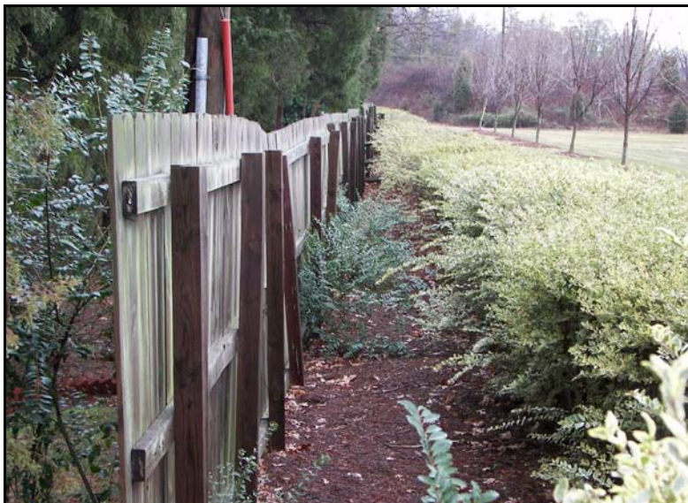
Wood perimeter fence Property Maintained by Others