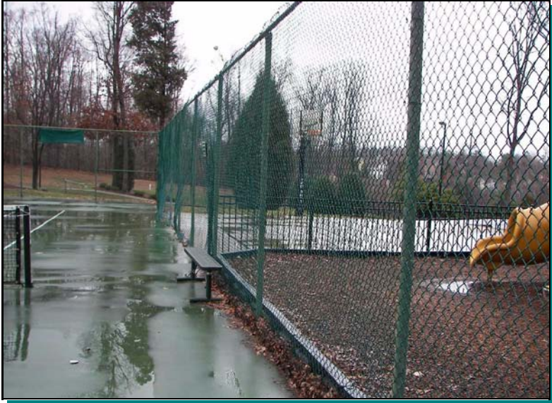
Tennis court fence - Note bent section