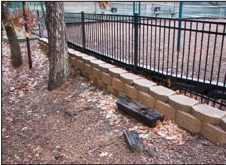
Retaining wall addition at playground Operating Budget