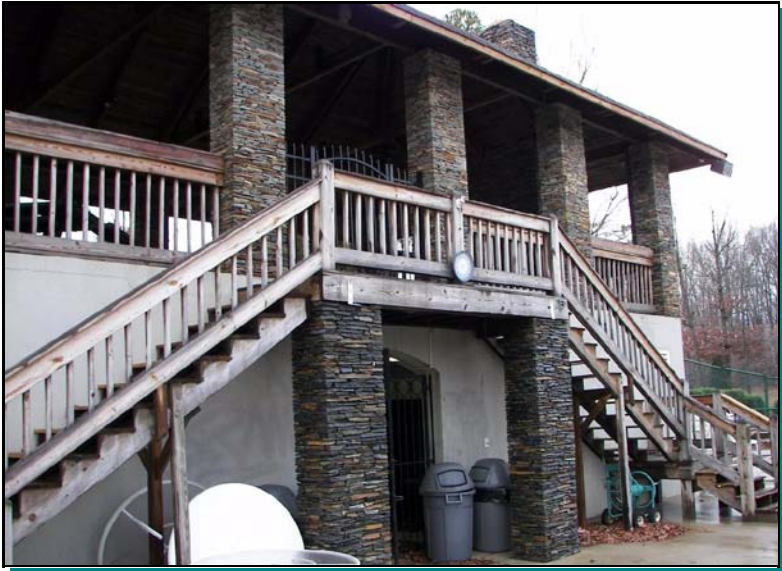
Pavilion wood stairs