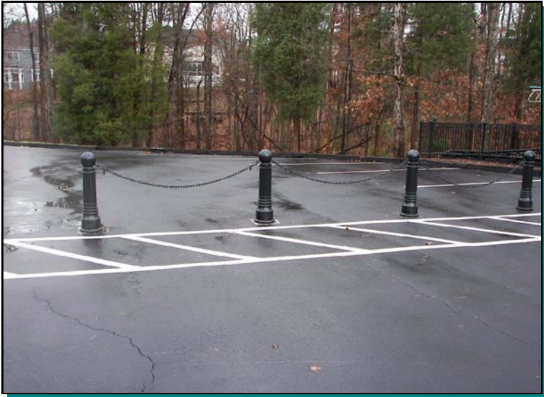
Concrete bollards Long-Lived