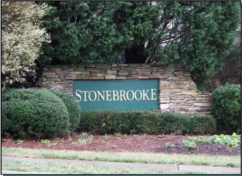
Typical community monument