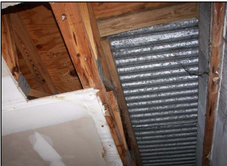
Pavilion mechanical room ceiling