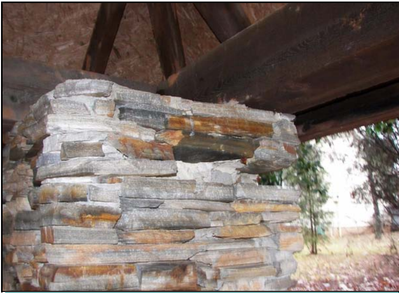
Mortar deterioration at guard house column