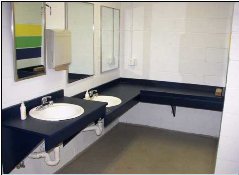
Pool house womens rest room