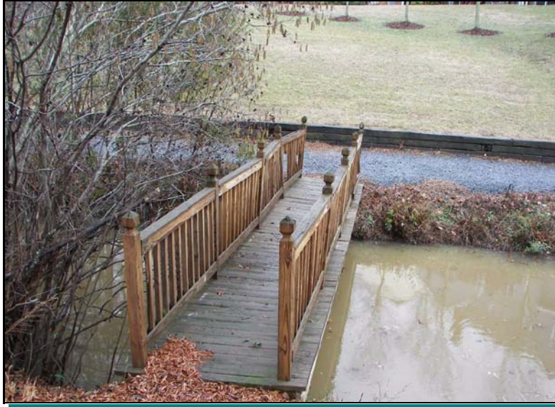
Pedestrian bridge - Note missing balusters Interim repairs through Operating Budget