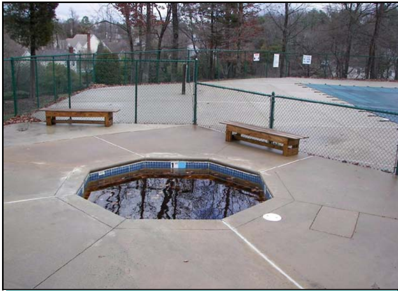
Baby pool in poor condition