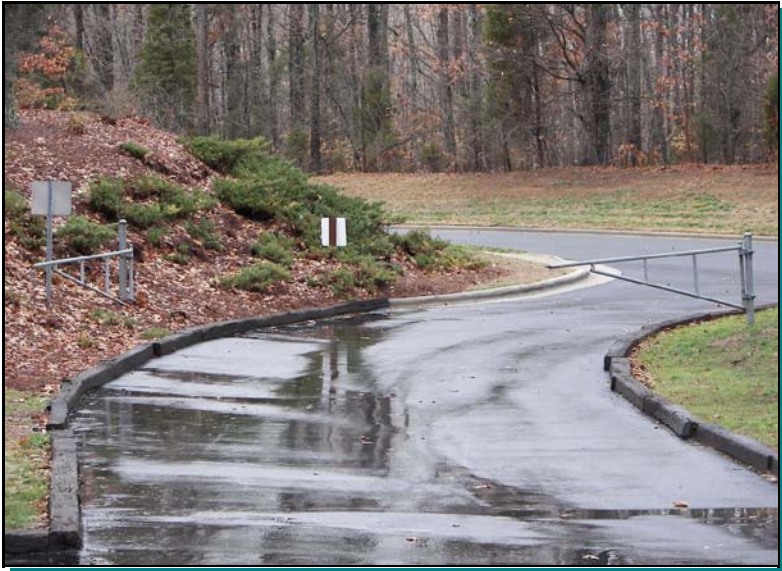
Asphalt pavement driveway and gate