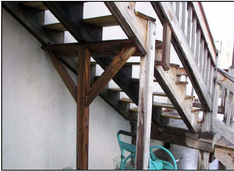
Pavilion stairs - Note extra support installed