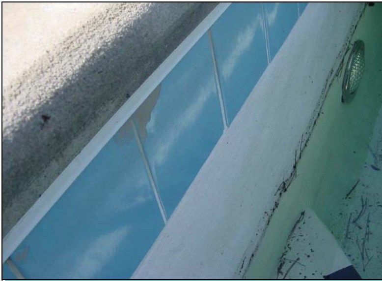
Fiberglass pool coating and minor tile deterioration