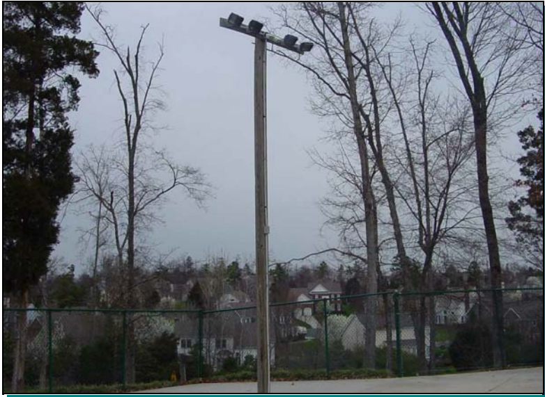
Light post and fixtures