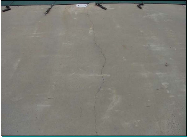
Minor crack in pool deck