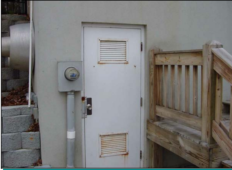
Rusted metal door - typical of all metal doors