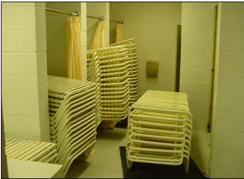
Pool house interior with furniture