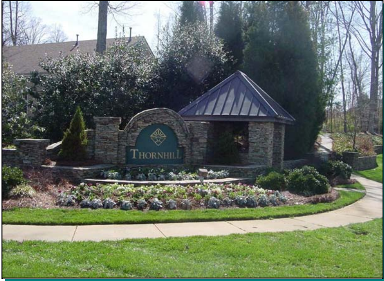
Entrance monument and guard house