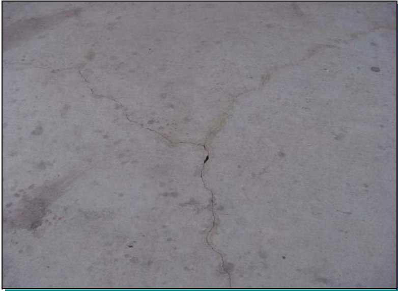
Cracks in concrete deck