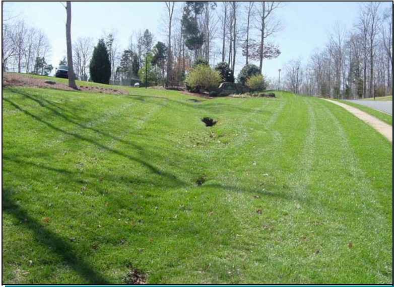
Erosion near pavilion