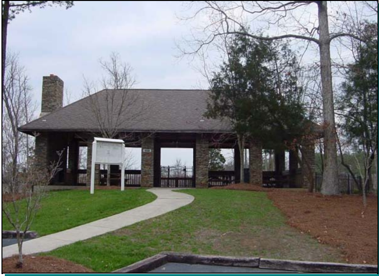
Pavilion front elevation