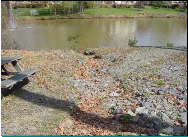
Erosion at pond