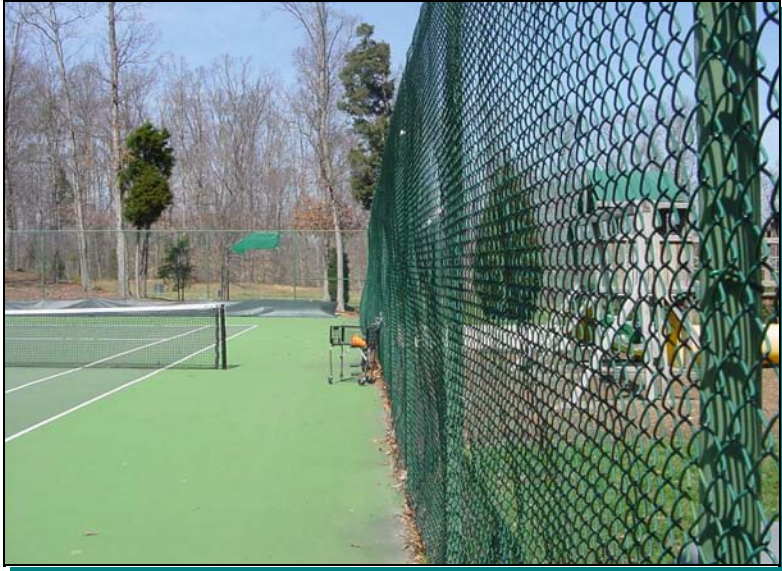
Tennis court fence