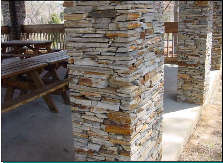
Missing stones at column