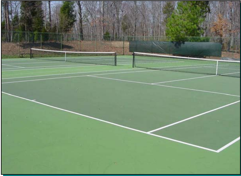
Tennis courts in good condition