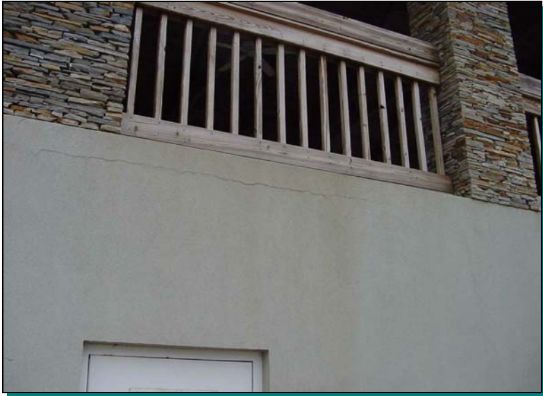
Crack in parge coat where concrete deck meets concrete block wall - typical at perimeter