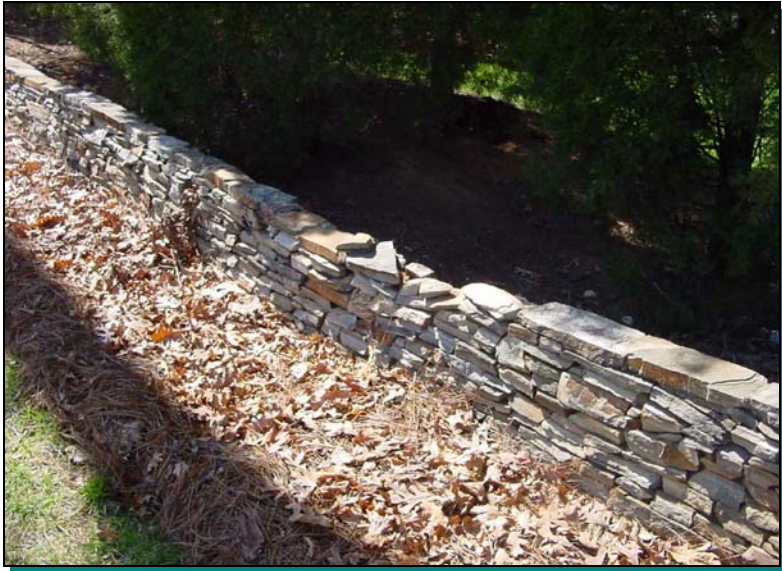
Monument wall deterioration