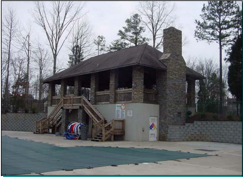
Pavilion rear elevation